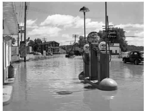
Cedar City, Missouri, 1951