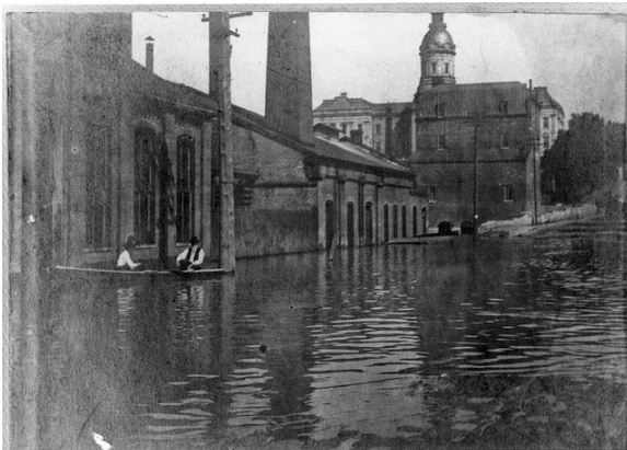
Jefferson City, Missouri, 1903

How would this sign assist in communicating and reducing risk in your community?