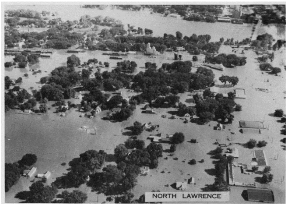
Lawrence, Kansas, 1951

How would this sign assist in communicating and reducing risk in your community?