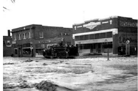
Choteau, Montana 1962