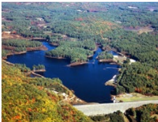
Aerial view of the U.S. Army Corps of Engineer's Everett Dam, U.S. Army Corps of Engineers photo.

NOAA Social Coast Forum , "Exploring the Values of the Coast," Charleston, SC, February 18-20