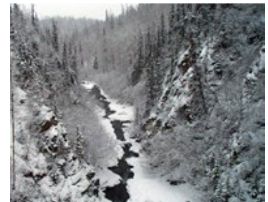
U.S. Army Corps of Engineers Engineer Research and Development Center Snow Interest Group photo.

Carolinas Climate Resilience Conference , Charlotte, NC, April 28-29