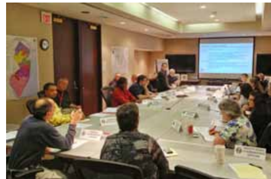
This is the group briefing of the Federal Disaster Recovery Coordinator.

For more information about the NDRF: http://www.fema.gov/national-disaster-recovery-framework .