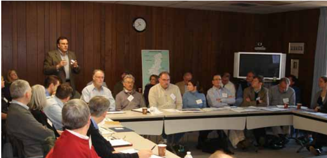
IWRSS Stakeholder forum with the Delaware River Basin Commission held December 13, 2012 at the DRBC office in West Trenton, NJ.

ports by summer 2013. A third charter under development will guide the efforts of a team to define requirements for a joint, earth system, water modeling framework.